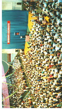
Lecture in Dalian, China (July 1994)