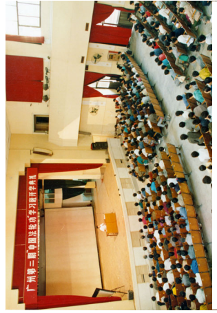
Second Lecture in Guangzhou, China (October 1993)