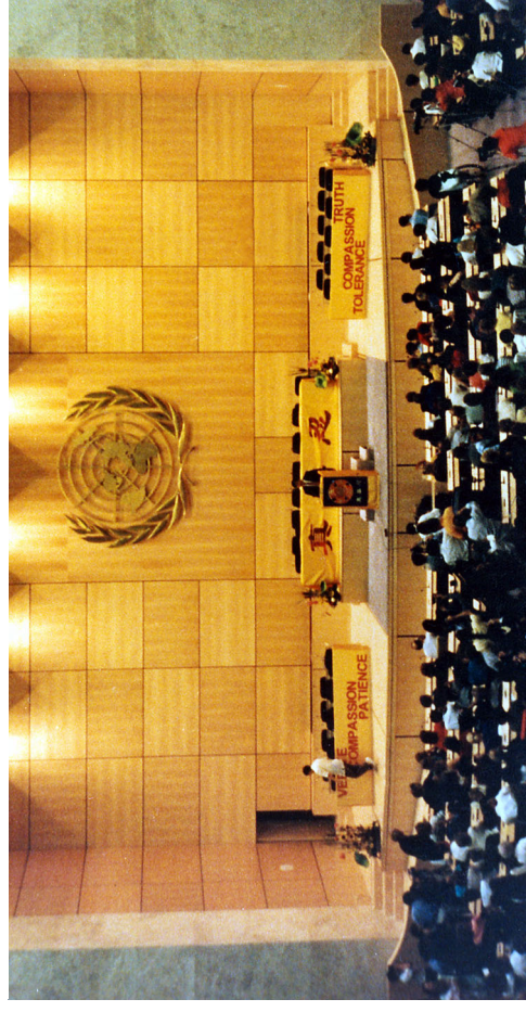
Lecture in the UN General Assembly Hall in Geneva, Switzerland (September 1998)