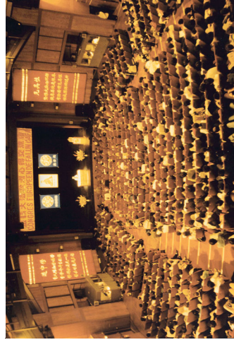
European Experience Sharing Conference in Paris, France (July 1999)