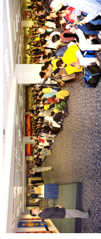
Lecture in San Francisco (October 2000)