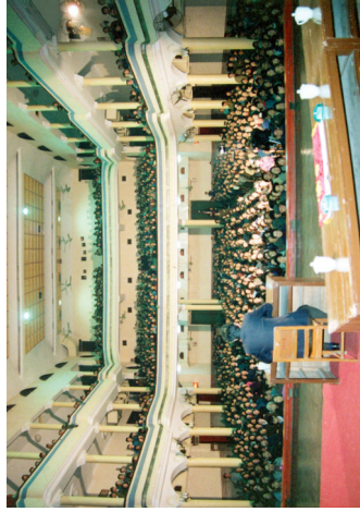
Lecture in Wuhan, China (March 1993)

Falun Gong’s founder, Mr. Li Hongzhi, traveled tirelessly across China and around the world teaching the principles of the universe, Truth, Compassion, and Tolerance. Invited by Qigong organizations from each area in China, during the two-year period from May 1992 to the end of 1994, Mr. Li traveled to almost all major Chinese cities to teach the practice, and gave 53 Falun Gong seminars during that time. Tens of thousands of people attended the seminars. In the later part of that period, there were four to five thousand people attending each seminar. Its scale was unprecedented at that time. Since 1995, Mr. Li has taught in Australia, Switzerland, Canada, the United States, and Singapore, among other countries. Wherever he has gone, many people and many countries have benefited from his teachings, winning Falun Gong international acclaim and much respect. Due to his outstanding contribution to humanity, Mr. Li Hongzhi was nominated for the 2001 Nobel Peace Prize by nearly 600 professors and government officials from 21 countries. Mr. Li was also nominated by 28 European Parliament members for the European Parliament’s Sakharov Prize in 2001 for Freedom of Thought.