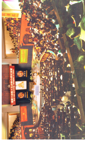
Lecture in Toronto, Canada (May 1999)