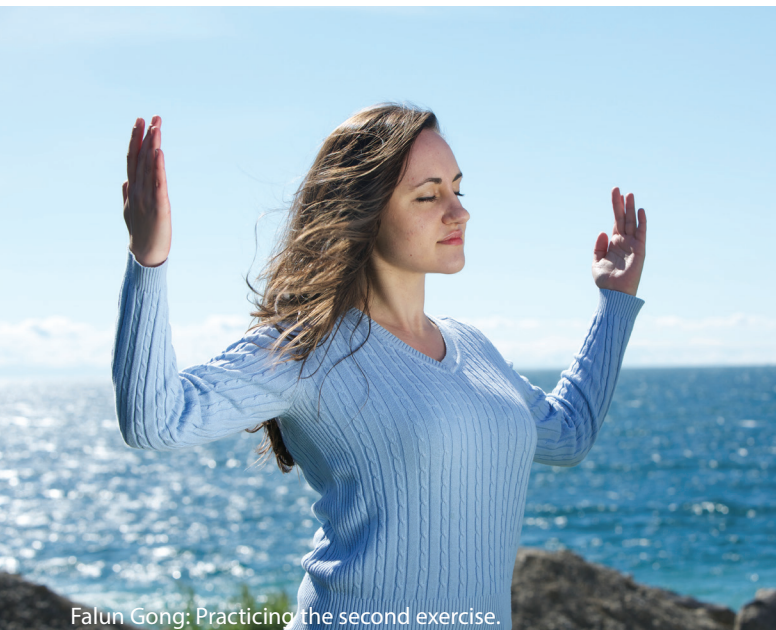
Falun Gong: Practicing the second exercise.